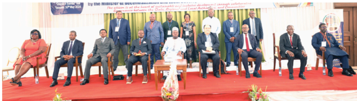
The objective is to improve the resilience capacity of communities.

■ The FCFA 190 billion project that spans a period of five years was kick-started by Decentralisation and Local Development Minister, Georges Elanga Obam on May 10, 2024.